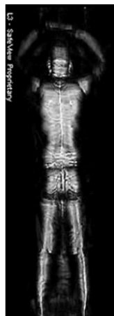
Millimeter wave image

The TSA has introduced Privacy Impact Assessments (“PIA”) over the past nine years to identify and mitigate different privacy risks associated with AIT. The PIAs issued in 2008, 2009, and 2011 reflect changes made in AIT procedures. First, in January 2008, the PIA indicated that AIT was in the initial pilot phase. 43 At that time, AIT was used as a secondary screening procedure, or additional screening due to “a compelling need for further investigation after an initial reading showing metal” on the X-ray machine. 44 Passengers were given the option of undergoing the normal secondary screening pat-down procedure or screening by an AIT device. 45 Additionally, in January 2008, the PIA clarified that an individual exercises participation and informed consent